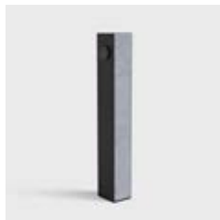
(Belgian) blue natural stone