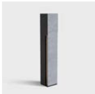
(Belgian blue natural stone)